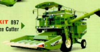
MALKIT 897 with Maize Cutter