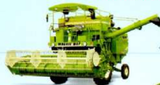
MALKIT 997 Self Propelled Combine Harvester