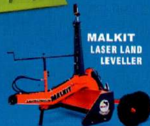
MALKIT LASER LAND LEVELLER