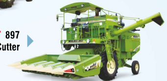
MALKIT 897 with Maize Cutter