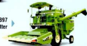
MALKIT 897 with Maize Cutter