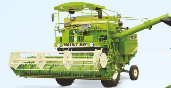
MALKIT 997 Self Propelled Combine Harvester