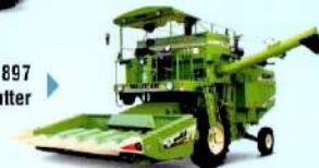
MALKIT 897 with Maize Cutter