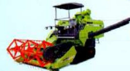
MALKIT 597 Champion Track Combine Harvester