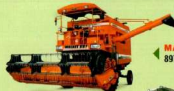
MALKIT 897 Axial Flow