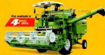
MALKIT - 897 SELF PROPELLED COMBINE