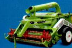
MALKIT STRAW REAPER