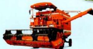
MALKIT 897 Axial Flow