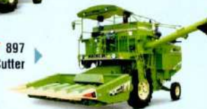
MALKIT 897 with Maize Cutter