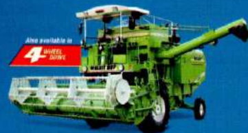
MALKIT - 897 SELF PROPELLED COMBINE