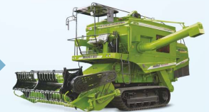
MALKIT 597 Champion Track Combine Harvester