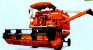
MALKIT 897 Axial Flow