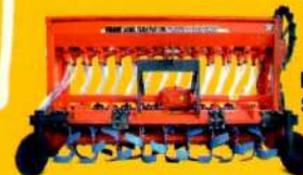
MALKIT Super Seeder