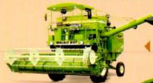
MALKIT 997 Self Propelled Combine Harvester