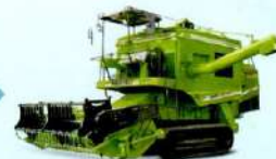
MALKIT 597 Champion Track Combine Harvester