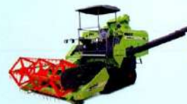
MALKIT 597 Partner Axial Flow Track Combine Harvester