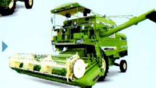
MALKIT 597 Partner Axial Flow Track Combine Harvester