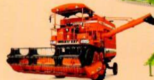
MALKIT 897 Axial Flow