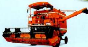
MALKIT 897 Axial Flow