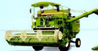
MALKIT 997 Self Propelled Combine Harvester