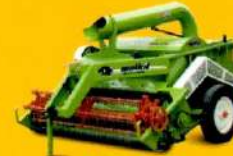
MALKIT STRAW REAPER