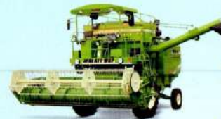
MALKIT 997 Self Propelled Combine Harvester