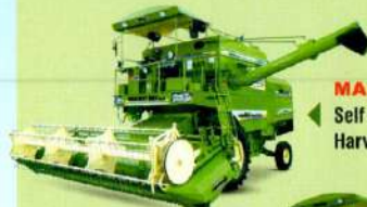
MALKIT 997 Deluxe Self Propelled Combine Harvester