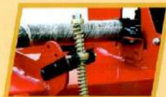
High Quality Spring