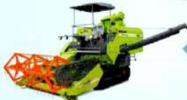
MALKIT 597 Partner Axial Flow Track Combine Harvester