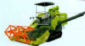
MALKIT 597 Partner Axial Flow Track Combine Harvester