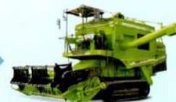
MALKIT 597 Champion Track Combine Harvester