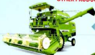
MALKIT 997 Deluxe Self Propelled Combine Harvester