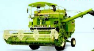
MALKIT 997 Self Propelled Combine Harvester