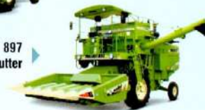
MALKIT 897 with Maize Cutter