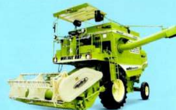
MALKIT - 897 KOMPACT SELF PROPELLED COMBINE HARVESTER