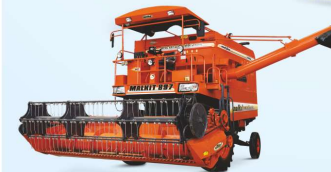
MALKIT 897 Axial Flow