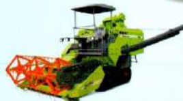
MALKIT 597 Partner Axial Flow Track Combine Harvester