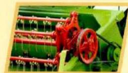
Outer Gear Bearing Support