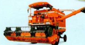
MALKIT 897 Axial Flow