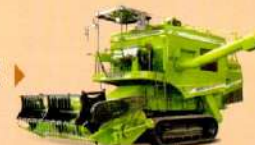
MALKIT 597 Champion Track Combine Harvester