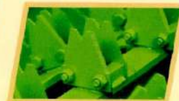
Double Blade Gripping