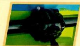
Heavy Duty Gear Box