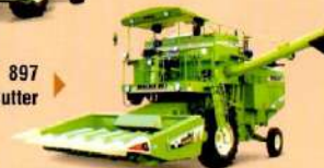
MALKIT 897 with Maize Cutter