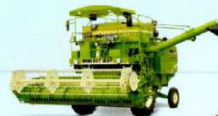
MALKIT 997 Self Propelled Combine Harvester