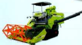
MALKIT 597 Partner Axial Flow Track Combine Harvester