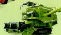
MALKIT 597 Champion Track Combine Harvester