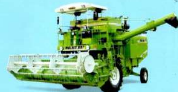
MALKIT - 897 SELF PROPELLED COMBINE