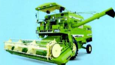
MALKIT - 997 Deluxe Model SELF PROPELLED COMBINE HARVESTER