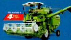
MALKIT - 897 SELF PROPELLED COMBINE