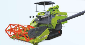
MALKIT 597 Partner Axial Flow Track Combine Harvester