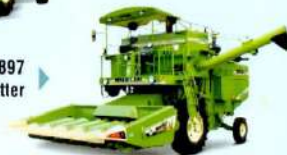
MALKIT 897 with Maize Cutter