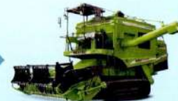
MALKIT 597 Champion Track Combine Harvester