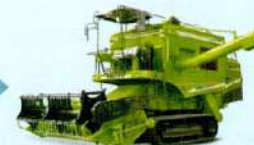
MALKIT 597 Champion Track Combine Harvester